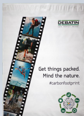
ideal for advertising: mailing bags printed to order in up to 8 colours

Naturally, we'll be very happy to cater to your individual requests wherever possible!