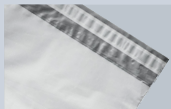
with permanent 10mm closure

DEBAPOST® Second life mailing bags are ideal for e-commerce and mail order companies. For example, they can be used reliably for courier deliveries and mail order clothing. Made predominantly (80%) of post-consumer recycled materials, they use resources sparingly and help to close the plastics recycling loop.